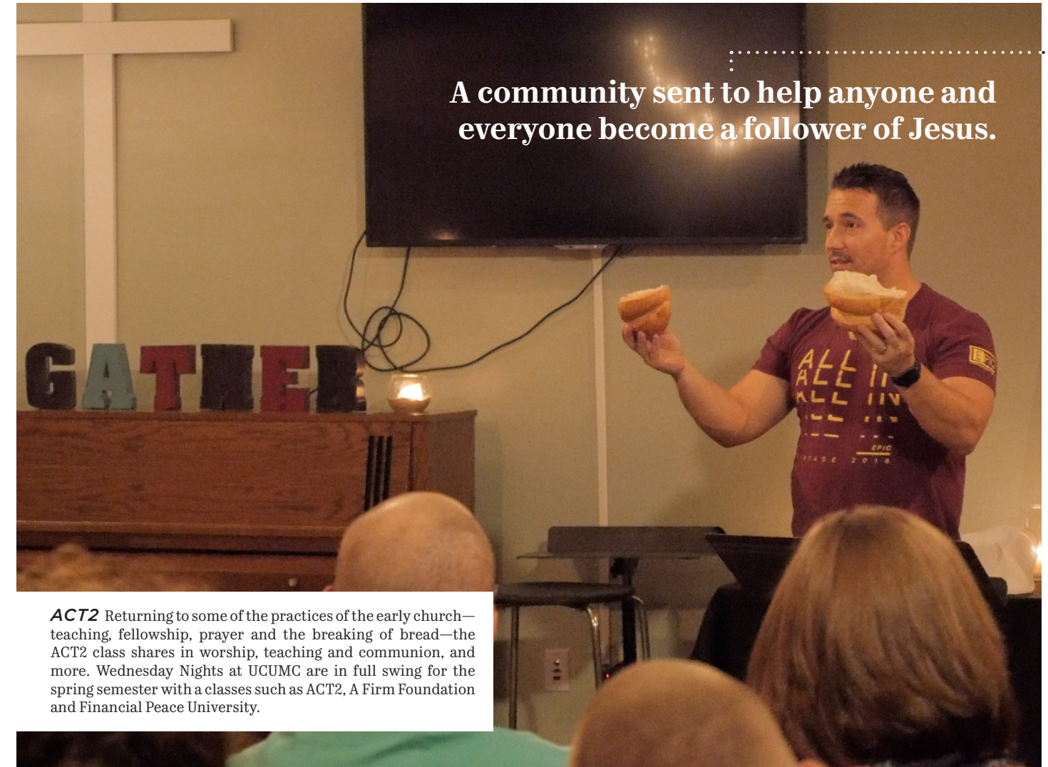
ACT2 Returning to some of the practices of the early church—teaching, fellowship, prayer and the breaking of bread—the ACT2 class shares in worship, teaching and communion, and more. Wednesday Nights at UCUMC are in full swing for the spring semester with a classes such as ACT2, A Firm Foundation and Financial Peace University.